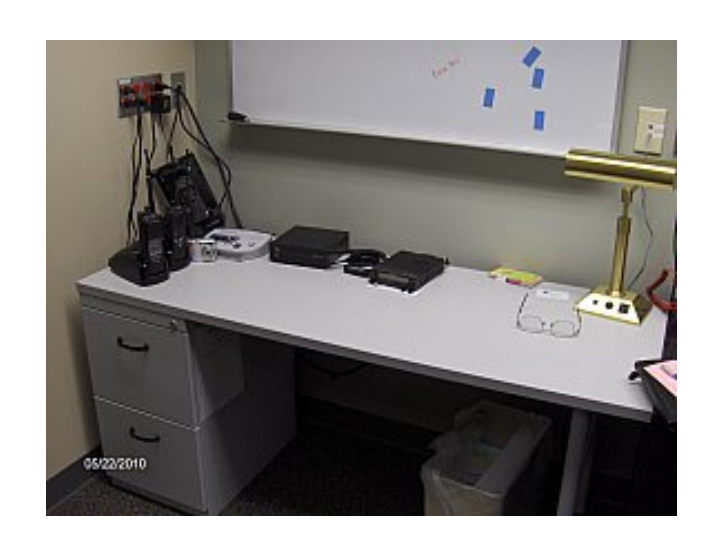
Our station at the Lapeer Hospital in the Emergency Room