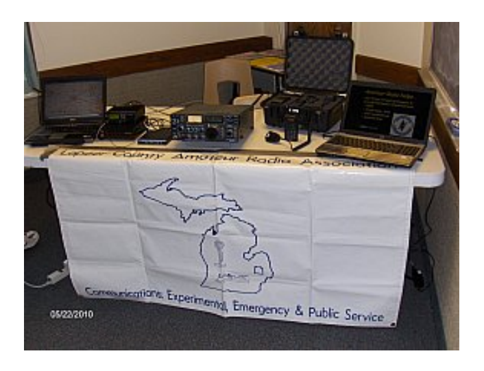
The LCARA display at the LDS Church preparedness fair display